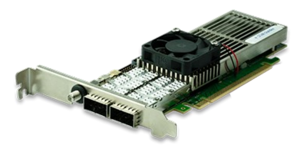
STAR-Ultra PCIe Interface

The STAR-Ultra PCIe Interface is controlled by a host PC, connected by an eight-lane Gen 3 PCIe interface, and has two quad-lane SpaceFibre interfaces. Each SpaceFibre lane can operate at a data signalling rate of up to 7.5 Gbit/s, resulting in a maximum link speed of 30 Gbit/s.